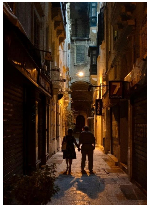
Night Stroll, Valletta

Second Prize winner for "Women in the 21st Century" theme competition for the IV International Biennial of Photography, Ecuador, May 2022