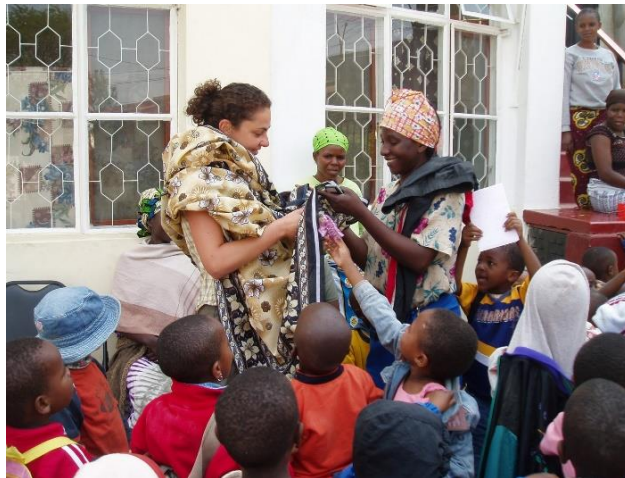
With some of the school children she taught in Tanzania