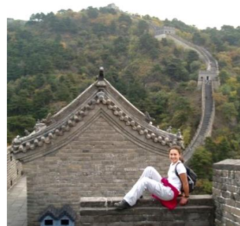
On the Great Wall of China