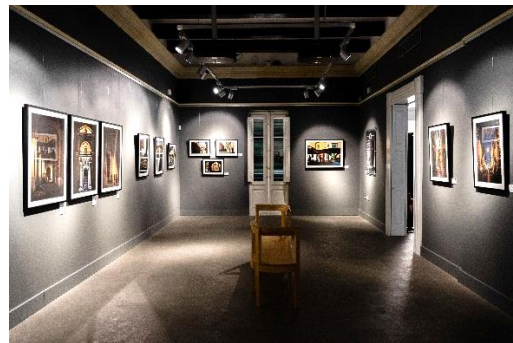
Some of the frames at the exhibition

Her first solo photography exhibition, "Memories of My Island" , was held last summer at the Malta Postal Museum in Valletta. The exhibition showcased her spin on typical Maltese streets.