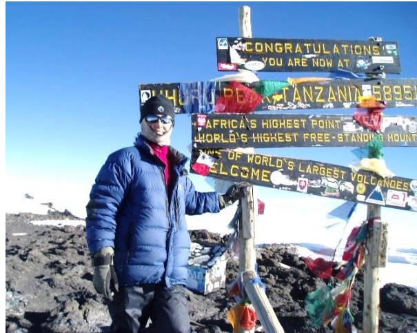
At the top of Mount Kilimanjaro, Tanzania