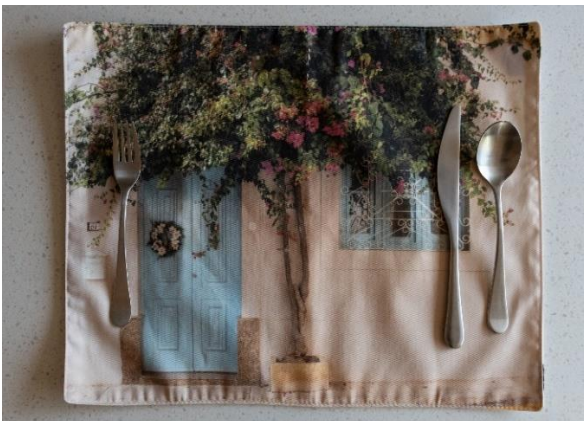
Light blue door placemat