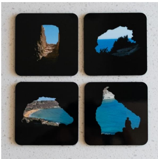
Set of four coasters with photo silhouettes of the Mixta Cave, Gozo

This month, it was Ted Gauci who selected the venue and arranged the day and time.