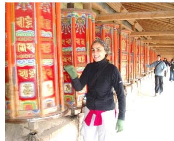
Spinning prayer wheels at Labrang Monastery, Tibet