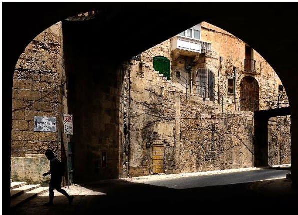
Under the Gate, Valletta