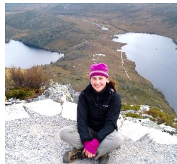
On top of Cradle Mountain, Tasmania, Australia